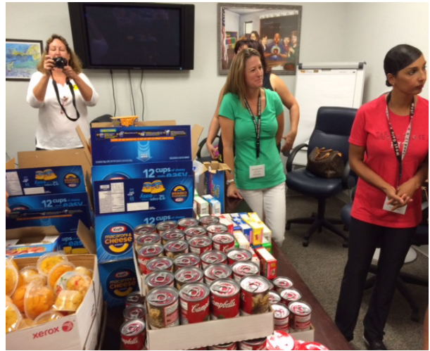
THERE WERE SEVERAL TEACHER VOLUNTEERS TO SORT AND BAG FOOD FOR STUDENTS TO BE PUT IN IN THEIR BACKPACKS ON FRIDAY AFTERNOON TO BRING HOME FOR A MEAL ON WEEKENDS