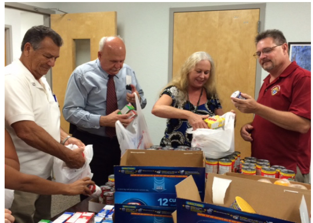
CHARITY IS THE FIRST PRINCIPLE OF THE KNIGHTS