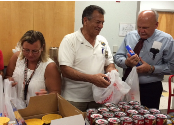
MANY STUDENTS GO HUNGRY ON WEEKENDS