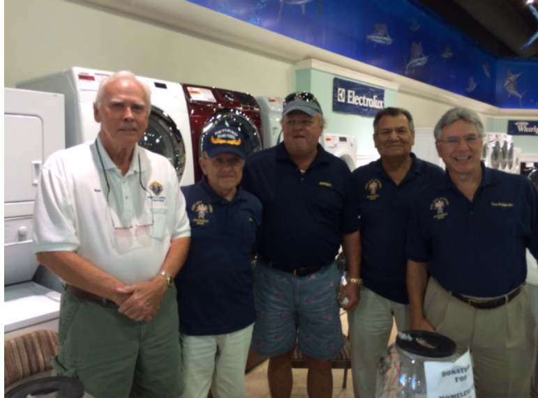
MR.JETSON JOINS THE KNIGHTS AS THEY TAKE DONATIONS FOR HOMELESS VETERANS